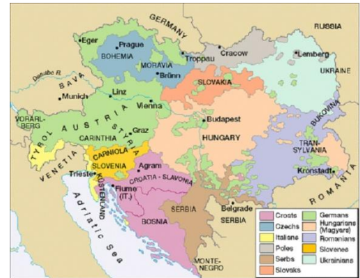
Nationalities within the Empire